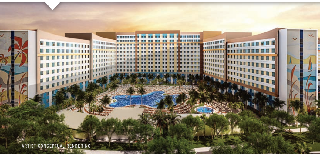
ARTIST CONCEPTUAL RENDERING